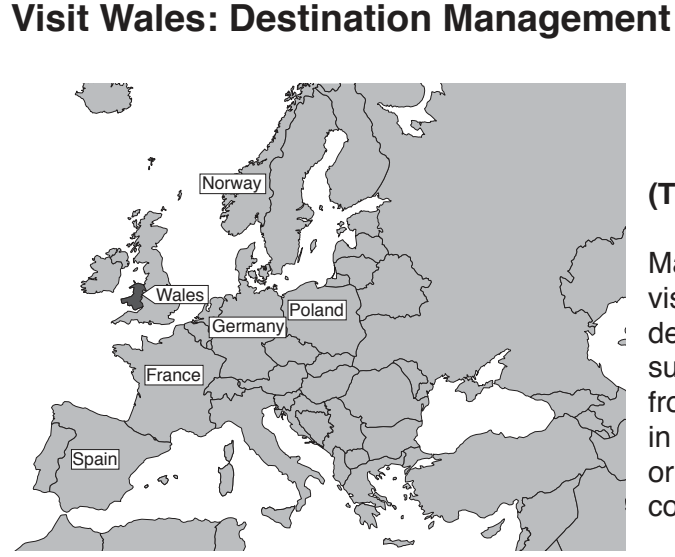
Fig. 1 for Question 1