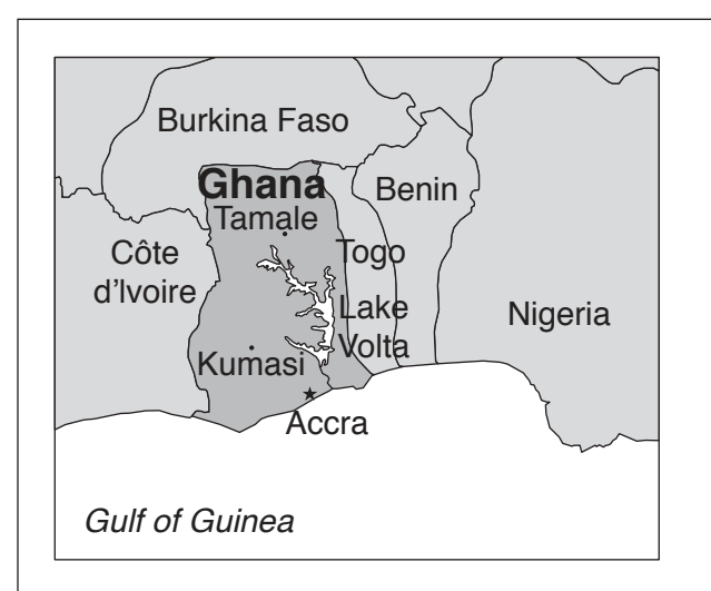
Fig. 2 for Question 2

Ghana is a nature lover's delight. Its sunny climate and fertile, well-watered soils sustain an enchanting variety of wildlife, ranging from elephants to monkeys and marine turtles to crocodiles. More than 5% of the country has official protection including 16 national parks. The most popular tourist destinations in Ghana are the very large Mole National Park in the north and Kakum National Park near the coast.